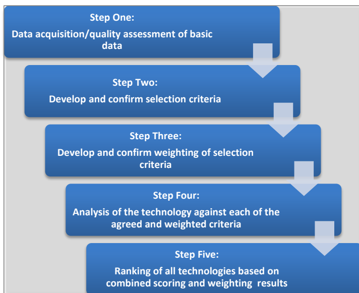
Figure 1: Five-Step-Technology Selection Procedure for wastewater treatment plants with a design capacity of up to 5,000 PE